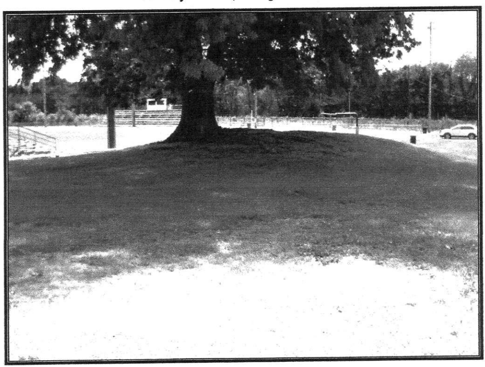
Cemetery 46WA322, looking southwest.